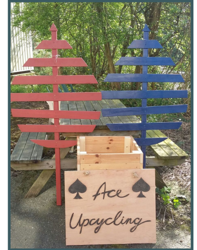
Garden Leaf Ornaments £10