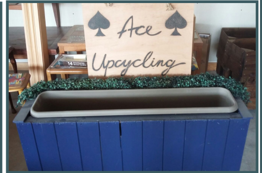
Large handcrafted planters £15