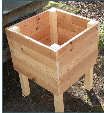
Garden Planter painted grey or off white £25