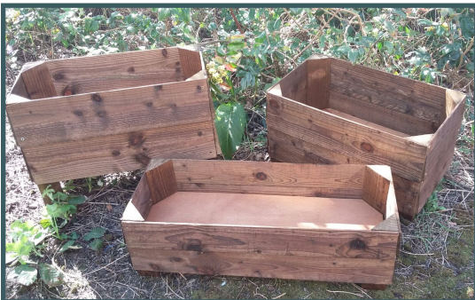
Beautiful Handcrafted planters £17.50