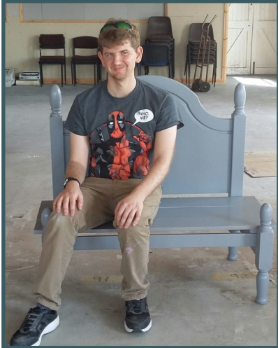
Recycled Garden Bench £60